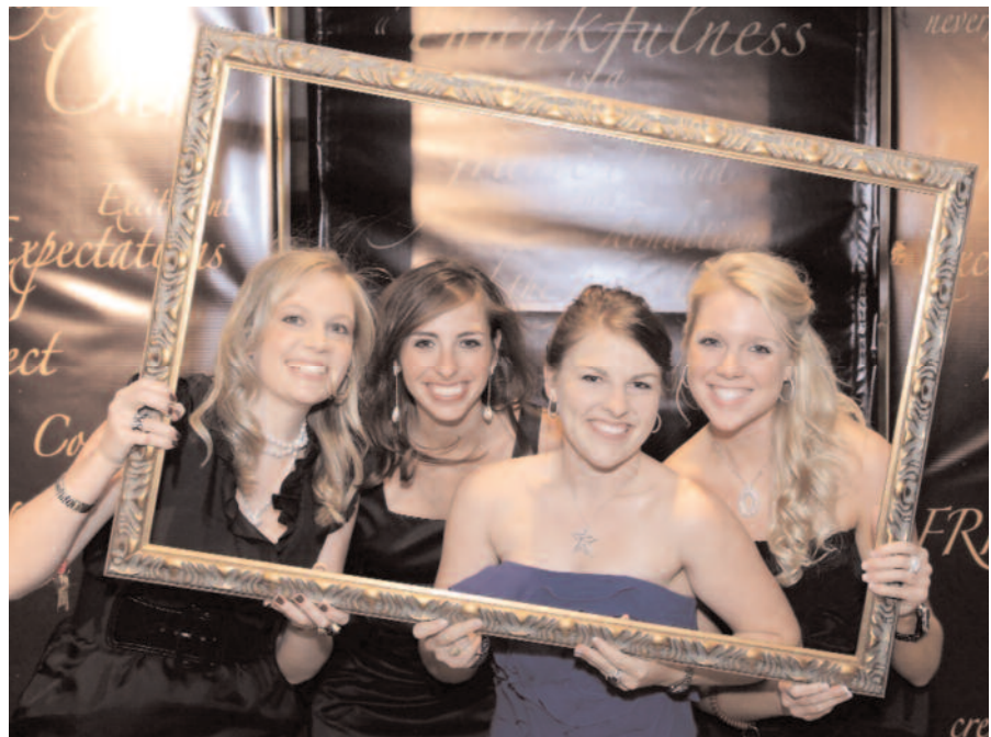
David Gardner Jewelers celebrated its 25th anniversary with the theme, "Thankfulness is a Frame of Mind." Guests were photographed holding the frame.