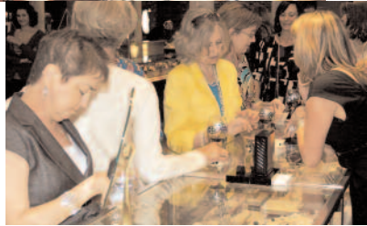
At David Gardner Jeweler's David Yurman event, guests took home handpainted wine glasses and enjoyed wine and cheese pairings.

ENTERTAINMENT > David Gardner: A local stylist met with customers to talk about their face shape, their style and what type of Yurman wearer they are. Benari Jewelers: A fashion show; a mime greeted the guests; French music played on the sound system.