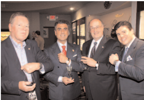
At Manfredi Jewelers, collectors enjoy comparing watches, left; talking about watches, right; and even disassembling watches, below. Often, the featured speakers are watch-industry legends.