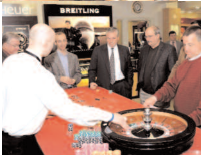
Top: Playing for store credit at Asanti Fine Jewellers. Middle: Browsing at Benari Jewelers' men's night. Bottom: Spinning the roulette wheel at Windsor Jewelers.

WHEN > 6 p.m. to 2 a.m. on a weeknight. EQUIPMENT > Poker table tops to place over rented tables, chips, logo playing cards, a bar.