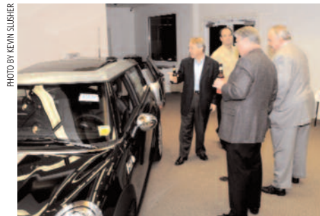
Men mingle with Mini Coopers at Windsor Jewelers.

THE RESULT > "We have it early enough in