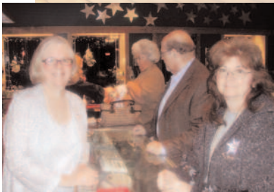
Shaw & Sons Family Jewelers attracted 300 people on a snowy day last year by hosting the jewelry-cleaning event, A Sparkling Affair.